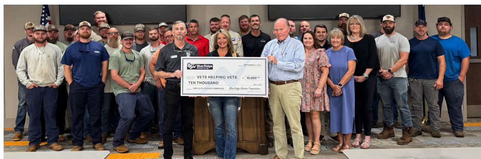
Representatives from Vets Helping Vets celebrate with co-op employees at Blue Ridge’s Westminster office.