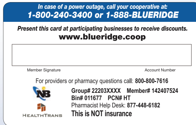
Back of Card