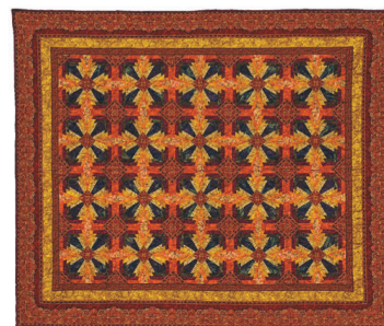
Celebration quilt used with permission from Gloria Loughman

Opportunity to win the beautiful Symphony Quilt (Tickets $1 each or 6/$5; need not be present to win) For more information visit Lmqg.org